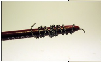
Twist the Razorwire around a brush. Glue it to the base...