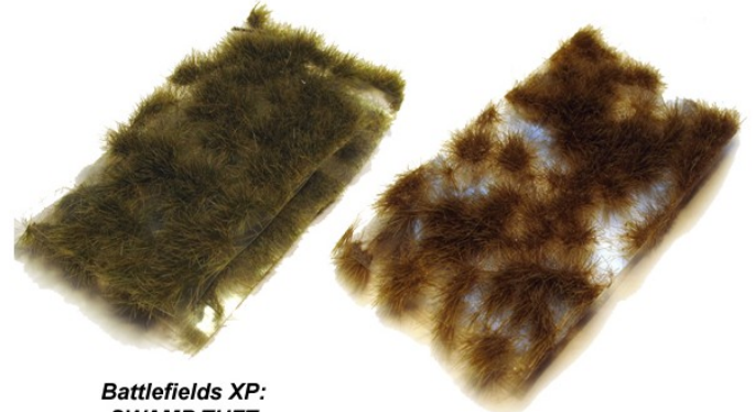
Battlefields XP: SWAMP TUFT